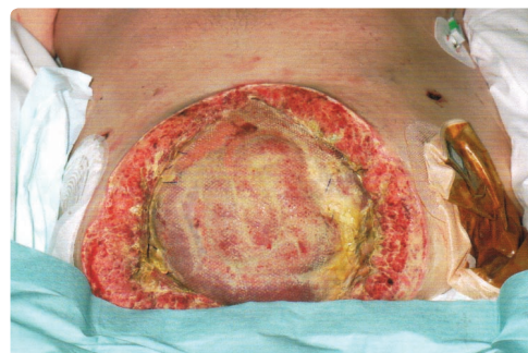
Fig. 3 (DAY 11)

Talley Medical products are manufactured to comply with BSI, IEC, UL and other European safety standards. Talley Medical design and manufacture products to conform to the requirements of ISO9001:2000, ISO13485:2003 and Directive (93/42/EEC) Annex II (excluding Section 4). Every care has been taken to ensure that the information contained in this brochure was correct at the time of going to press. However, Talley Medical reserves the right to modify the specification of any product without prior notice in line with a policy of continual product development. Our standard terms and conditions apply. © Talley Group Limited 2008. All rights reserved.