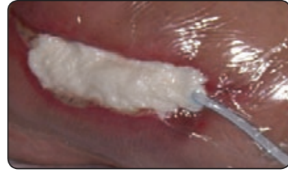
Example of sealed wound using moistened gauze and a silicone drain

to moist, not wet to dry. The flat drain was then connected to a NPWT pump unit and the pressure was initially set at 80mmHg of continuous negative pressure 2 . Canister changes took place weekly or whenever it was felt necessary.